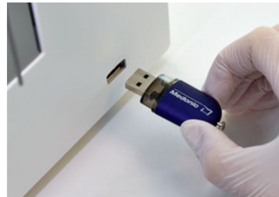
Medonic M-series M32 analyzer users enjoy improved data communication thanks to a broad selection of connectivity options.