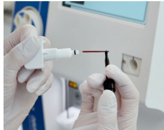
Medonic M-series M32 analyzers deliver a full CBC from just 20 \mu l of blood. Perfect for children and blood banks!

For these occasions, the M32S with Autoloader is the ideal instrument to have on your bench. As the top-of-the-range model in the new M32-series, it's the perfect walk-away analyzer and ideal for many small to medium-sized hospitals. Just pre-load up to 2 x 20 samples and let it do the work!