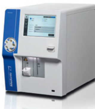
Medonic M32M – five-sample mixer is ideal for doctors' offices and small labs.