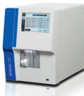
Medonic M32B – even the basic model includes shear-valve technology.

USB port is evidence of much improved connectivity and communication.