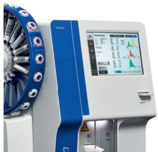
M-series M32S with Autoloader is ideal for small to medium-sized hospitals needing walk-away analysis functionality.