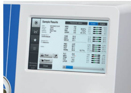
Modern user-interface. Its clean, uncluttered design promotes efficient operation and accurate assessment of results.

Medonic M-series M32 hematology analyzers are part of a Total Quality Concept that comprises instruments, reagents, quality control materials and service – an unbroken chain of know-how in quality hematology measurements.