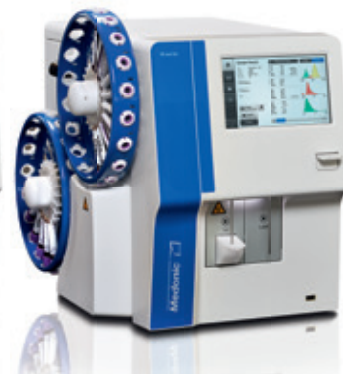
Medonic M32S – Autoloader for up to 2 x 20 samples. Just load and walk away.