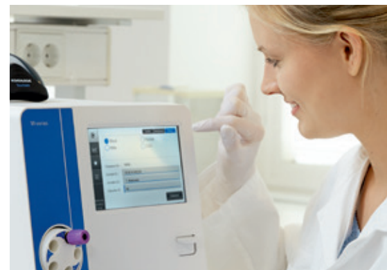
Improved software simplifies work processes and gives users better control of sample results and patient records.