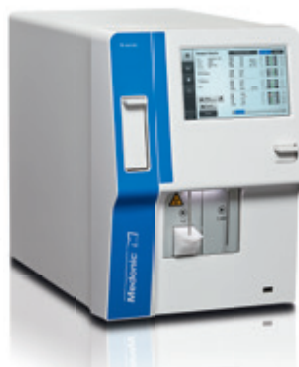
Medonic M32C – closed-tube sampling minimizes risks from contaminated blood.