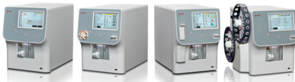
Swelab Alfa Plus Basic Swelab Alfa Plus Standard Swelab Alfa Plus Cap Swelab Alfa Plus Sampler