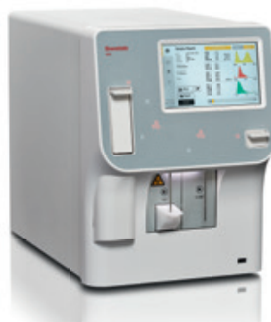
Swelab Alfa Plus Cap – closed-tube sampling minimizes risks from contaminated blood.