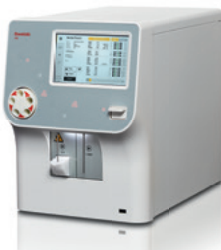
Swelab Alfa Plus Standard – five-sample mixer is ideal for doctors' offices and small labs.