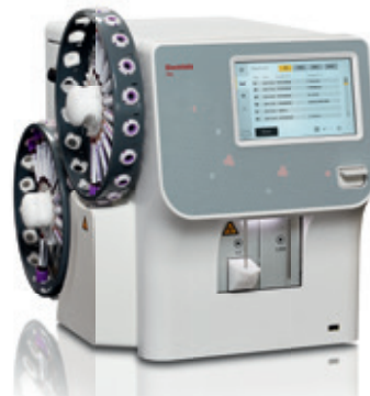
Swelab Alfa Plus Sampler – for up to 2 x 20 samples. Just load and walk away.