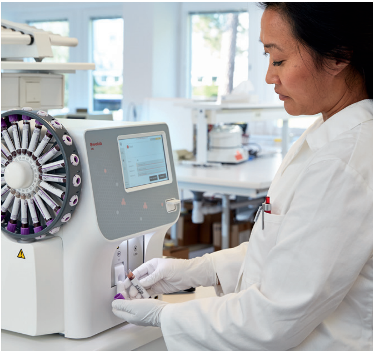
Swelab Alfa Plus Sampler is ideal for small to medium-sized hospitals needing walk-away analysis functionality.