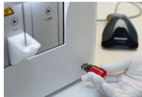
Swelab Alfa Plus analyzer users enjoy improved data communication thanks to a broad selection of connectivity options.

All analyzers feature a host of connection possibilities for printers, keyboards, barcode readers, USBs, etc. This better connectivity includes the new HL7 industrial standard protocol, now available together with the previous XML protocol. LIS connection is via an Ethernet port. Furthermore, this improved connectivity is very easy to use, as the front-panel USB port demonstrates.