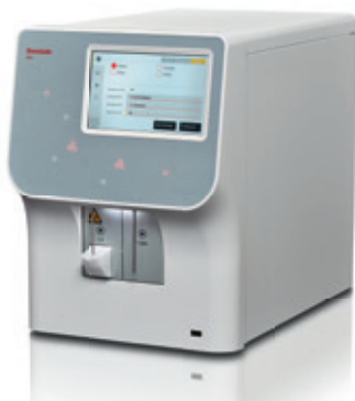
Swelab Alfa Plus Basic – even the basic model includes shear-valve technology.