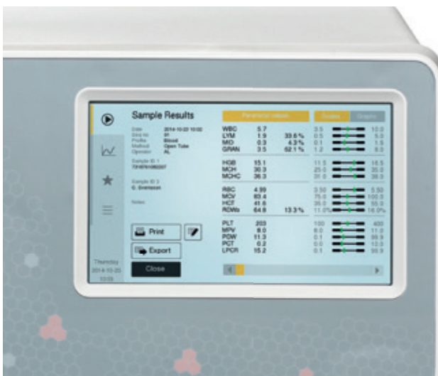
Modern user-interface. Its clean, uncluttered design promotes efficient operation and accurate assessment of results.